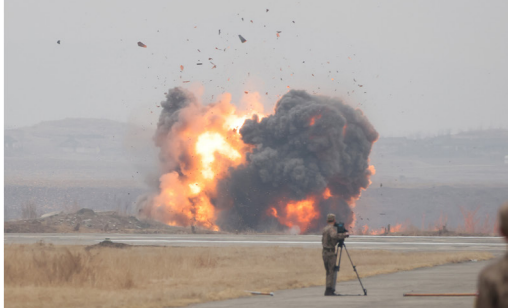
FROM PAGE 1

reconnaissance drone with the detective ability to track and monitor different strategic targets and enemy troops' activities in the land and sea. And it fully demonstrated the striking capability of suicide drones to be used for various tactical attack missions.