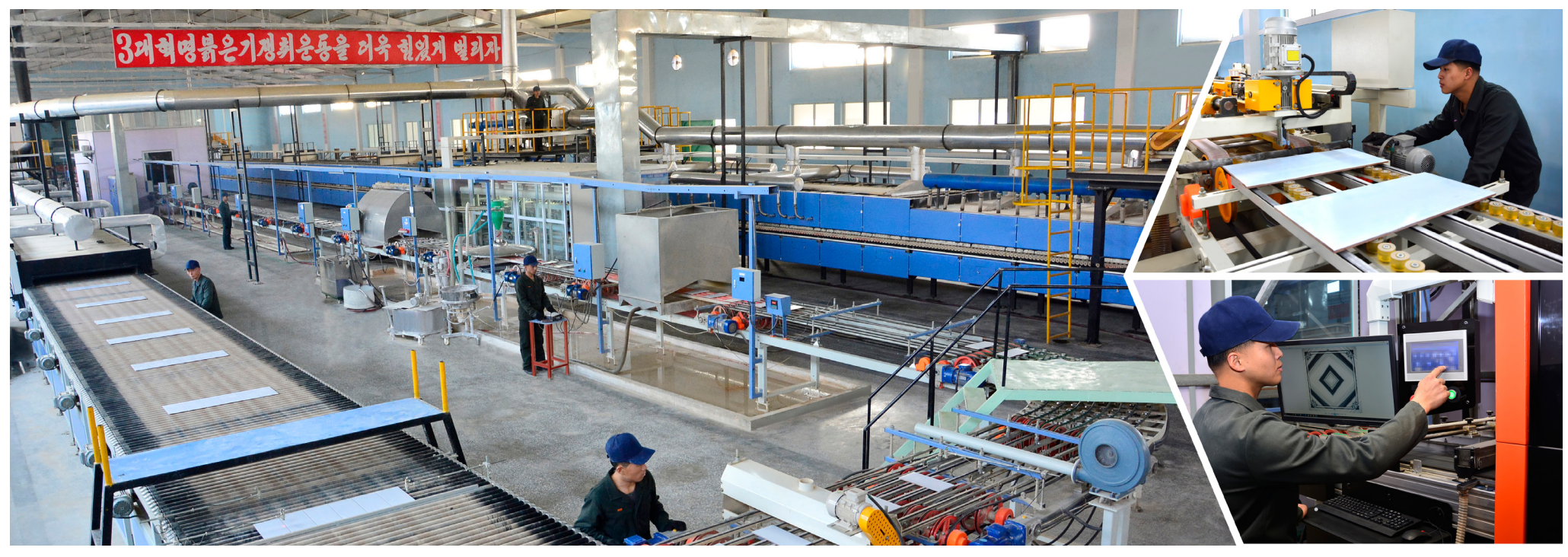
Various kinds of quality tiles are produced at the Kyongam Tile Factory.