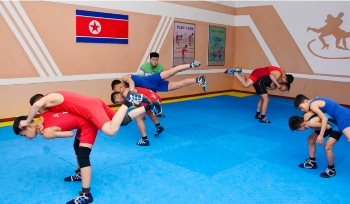
Schoolchildren learn various artistic and sports skills at the extracurricular groups of the Sariwon Schoolchildren's Palace.