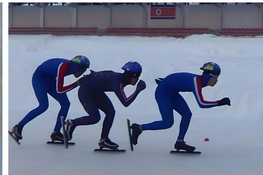
Scenes of impressive matches of the 14th National People's Games. CHEYUK SINMUN