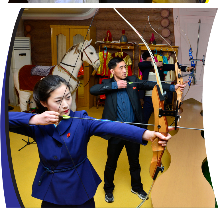
Working people enjoy rifle and pistol shooting and archery at the Meari Shooting Gallery.