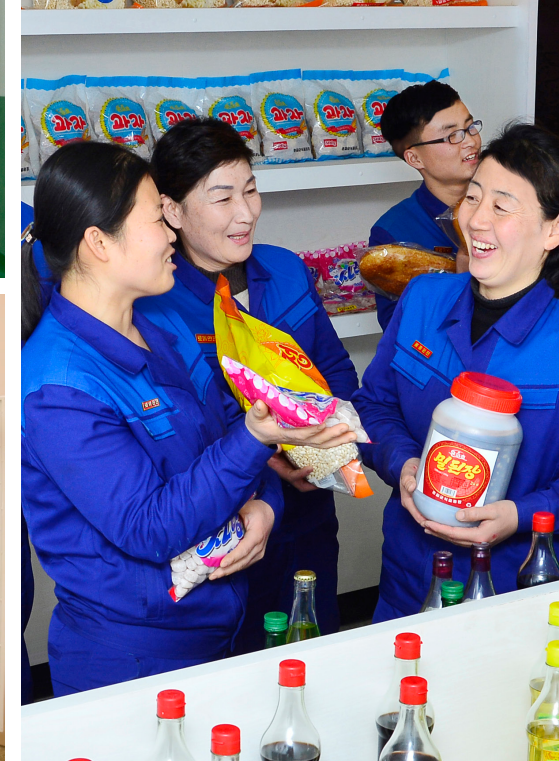
The newly built regional-industry factories produce diverse quality goods favoured by residents.